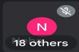
N 18 others